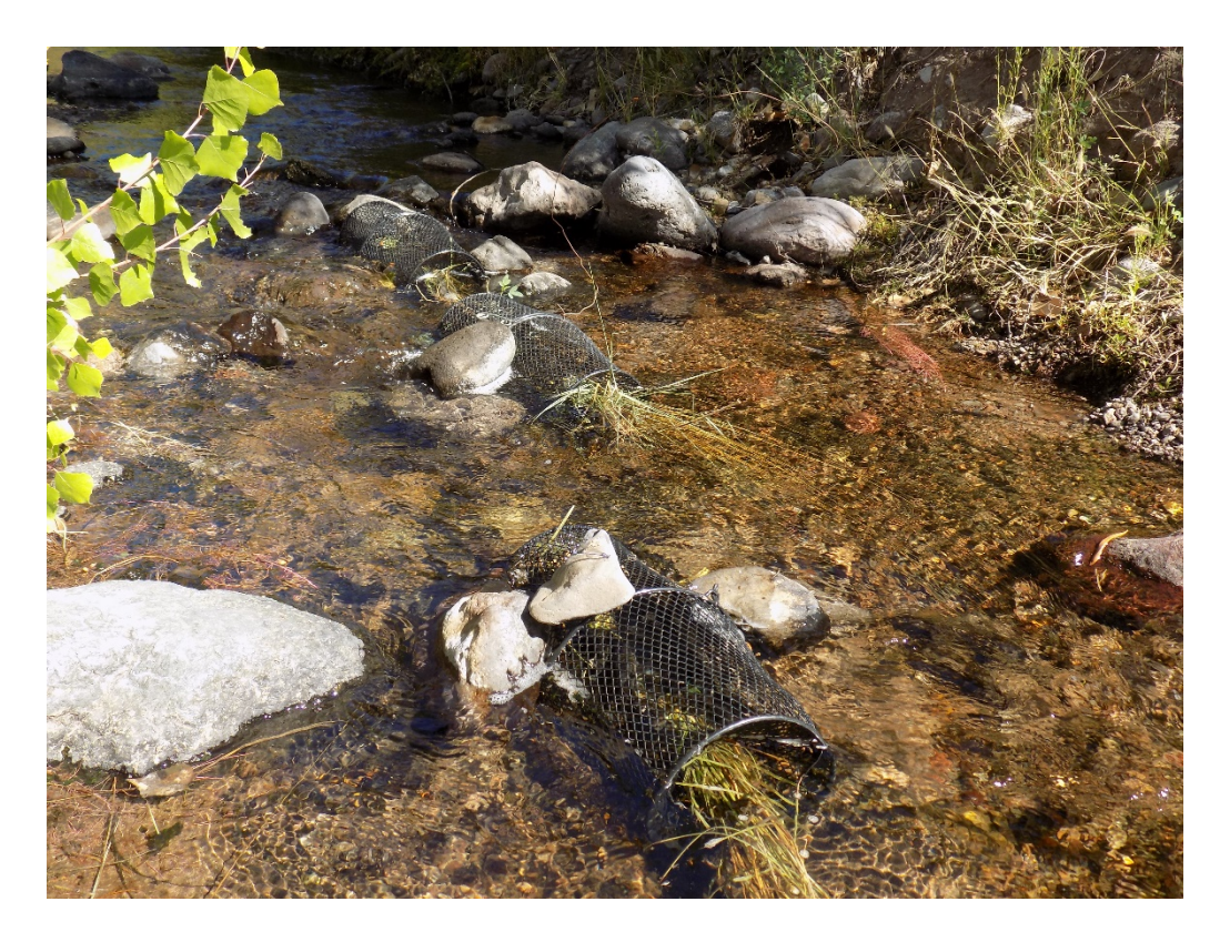
Figure 3. Rio Grande chub holding cages in Seco Creek box.