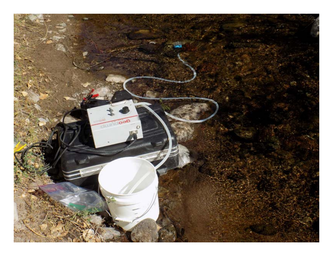
Figure 5. Sampling apparatus for collection of eDNA samples.