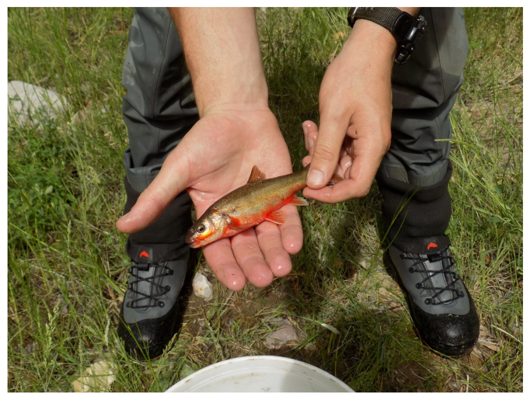
Figure 2. Rio Grande chub collected in lower Palomas Creek.