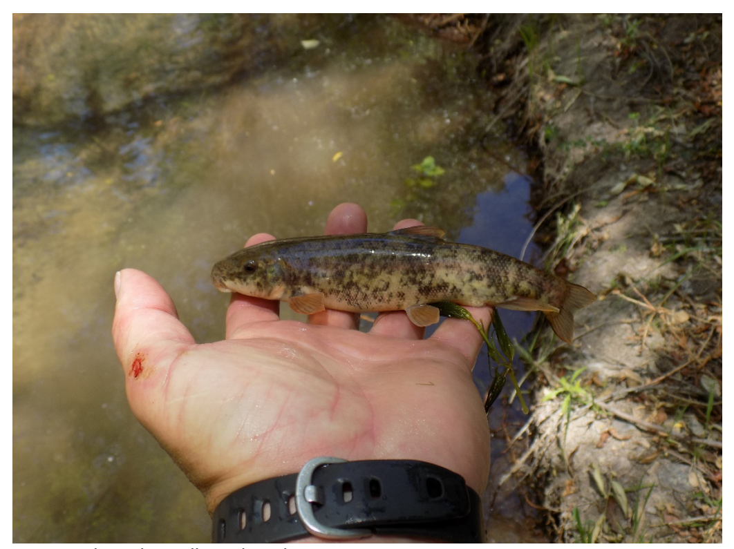
Figure 1. Rio Grande sucker collected at Alamosa Warm Springs